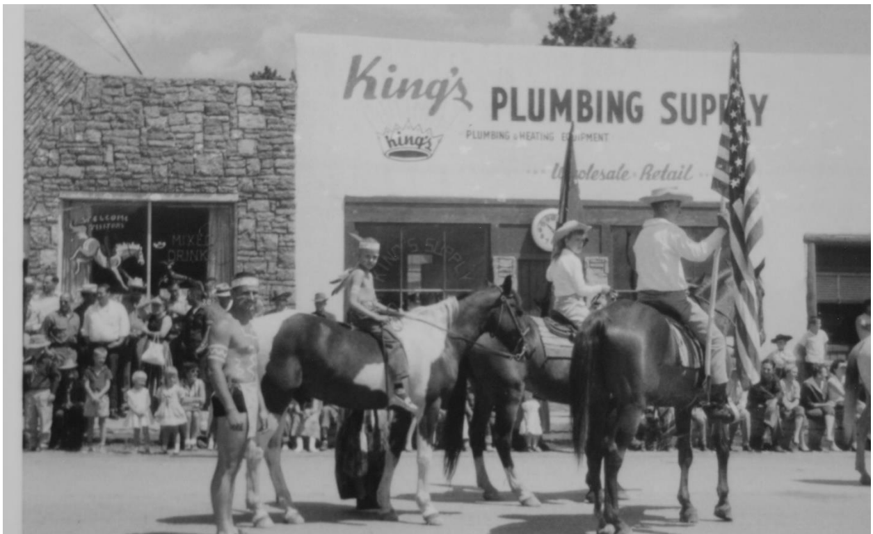
Rampart Range Youth Ranch in Woodland Park at the Ute Trail Stampede Rodeo Parade