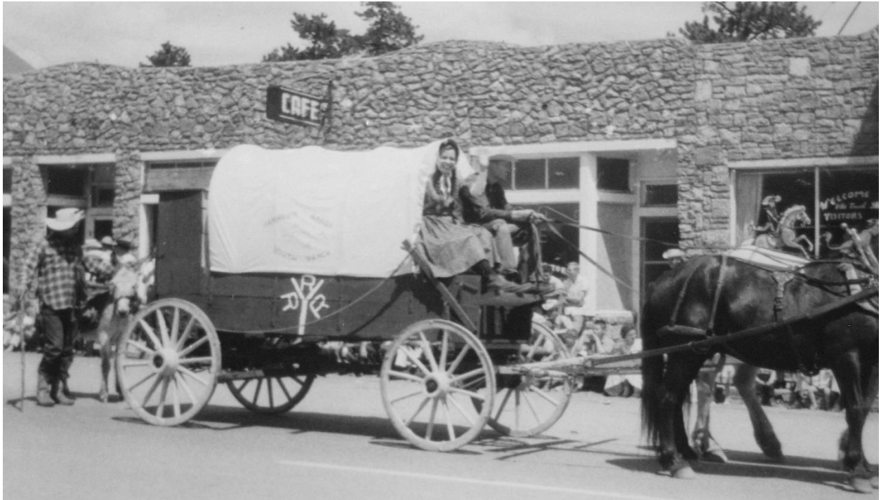
Rampart Range Youth Ranch in Woodland Park at the Ute Trail Stampede Rodeo Parade