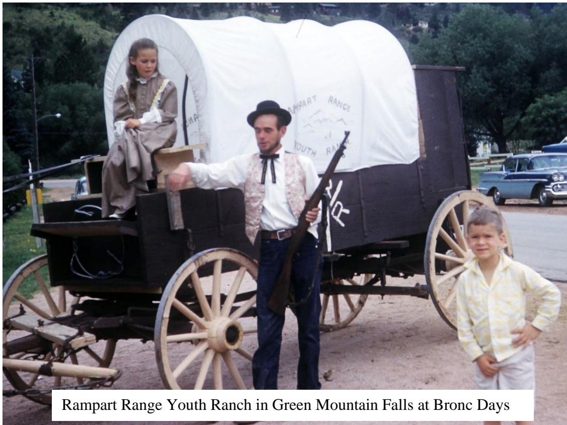
Rampart Range Youth Ranch in Green Mountain Falls at Bronc Days