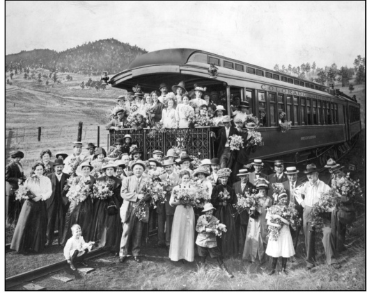
UTE PASS EDITION 2023 14-MONTH PICTORIAL CALENDAR

Calendars make great Christmas gifts! Especially when they are chock full of old photos! Available only at the Ute Pass Historical Gift Shop, 231 E. Henrietta Avenue, or Traveling Sales.