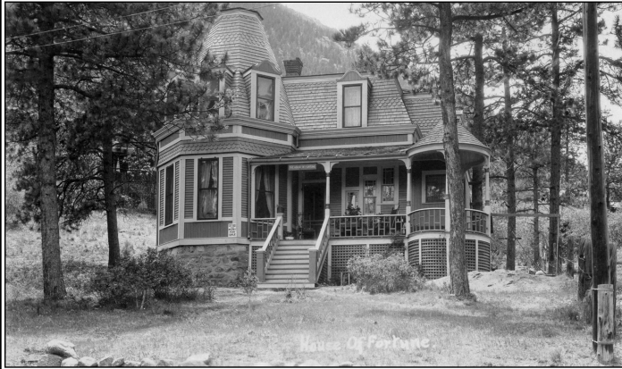
GREEN MOUNTAIN FALLS EDITION 2023 14-MONTH PICTORIAL CALENDAR