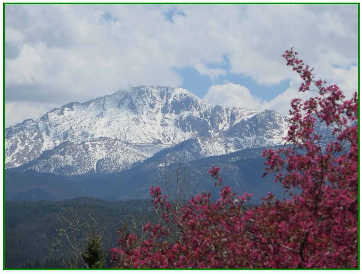
Spring has sprung in Woodland Park