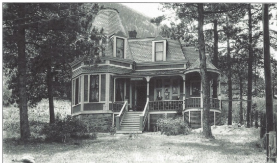
House of Fortune, ca 1922