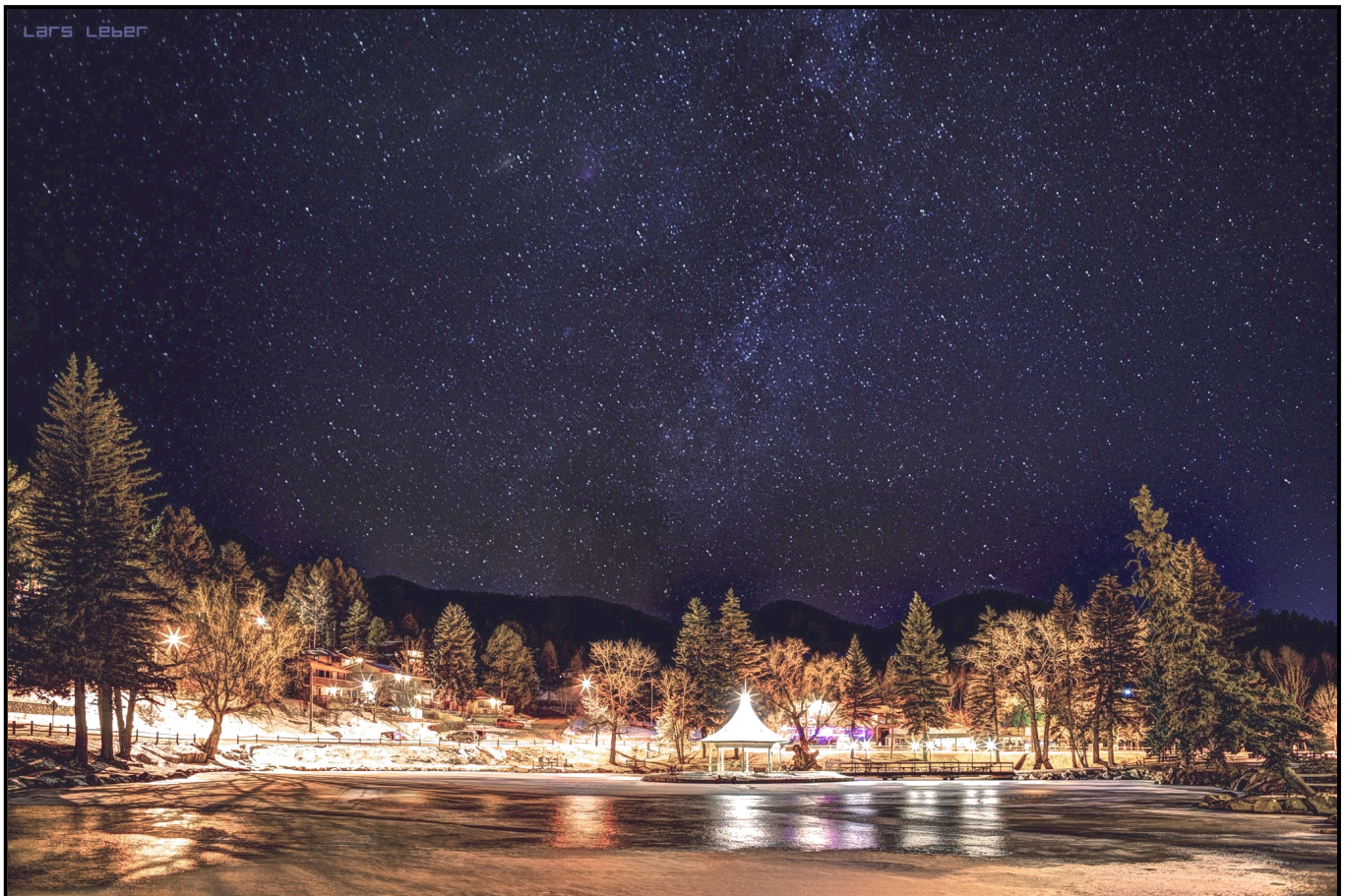
Green Mountain Falls

Yesterday, as we returned from a shopping trip to Colorado Springs, we witnessed what we regard as the most wonderful sight of our lives. The mountains, trees and shrubs were covered with a coating of hoarfrost, dazzling in its whiteness, the like of which we had never seen, and one seldom witnessed; all in all a most glorious and gorgeous spectacle, begging description, but one to be vividly stamped on memory's tablet as a tribute to Nature's wonderful powers.