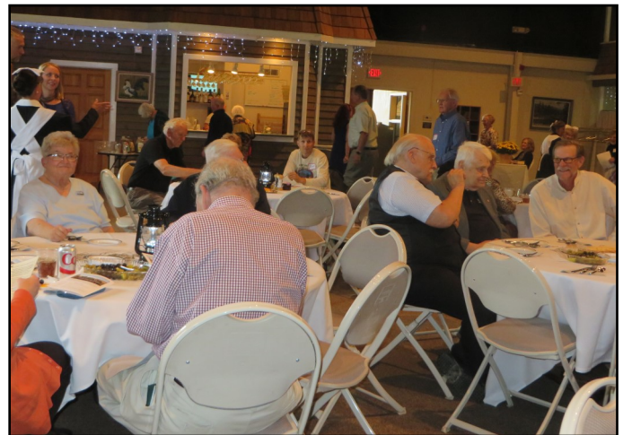
Attendees enjoy the banquet buffet catered by The Swiss Chalet