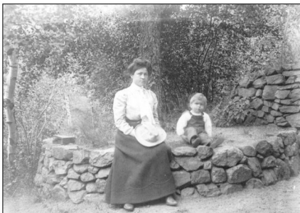
2018 Pictorial Ute Pass Calendar

This year, the Gift Shop is offering a choice of two calendars. The 2018 UPHS Calendars are just the right memento to help your out-of-town guests remember their summer vacation in beautiful Ute Pass. They cost $12 each and are available now in the Gift Shop.