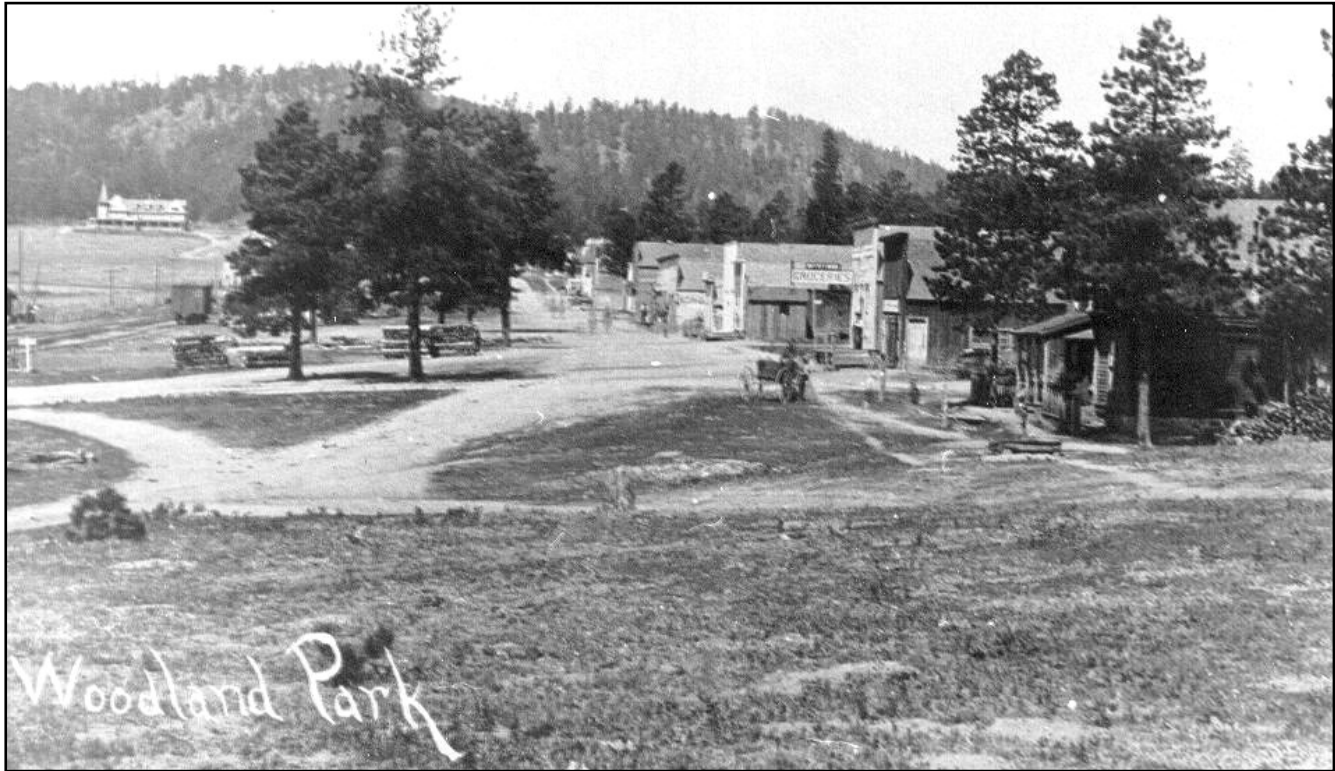
Downtown Woodland Park, Looking West, ca 1900