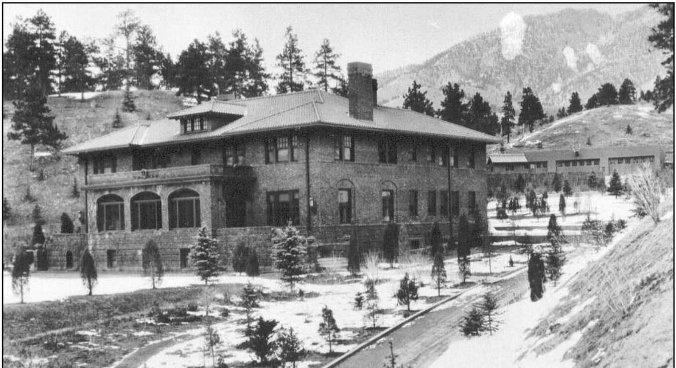
Marigreen Pines Dedication, 1923