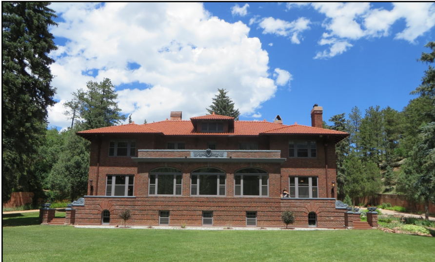
Marigreen Pines Mansion, Cascade, CO

Tickets for the 2018 Tours are available at the UPHS Gift Shop, located at 231 E. Henrietta Avenue in Woodland Park. For more information, call 719.686.7512. You may also download a ticket order form from our website: utepasshistoricalsociety.org .