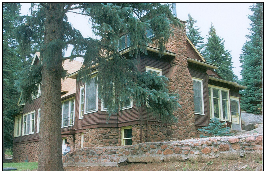
Ellinor Cottage Cascade, CO